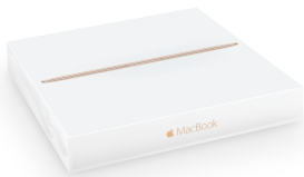
The 12-inch MacBook packaging is extremely material efficient and contains 60 percent recycled content by weight.