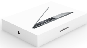
U.S. retail packaging of the 13-inch MacBook Pro contains an average of 38 percent recycled content by weight.