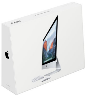
The 21.5-inch iMac retail packaging consumes 53 percent less volume and weighs 35 percent less than the original 15-inch iMac packaging.